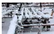
Winter 2007

Wear a poppy on Remembrance Day November 11 in honour of all who served and continue to serve our Country. Set an example for future generations. and the torch of remembrance will continue to burn brightly.