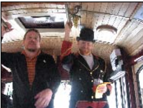
Our Guide & Conductor