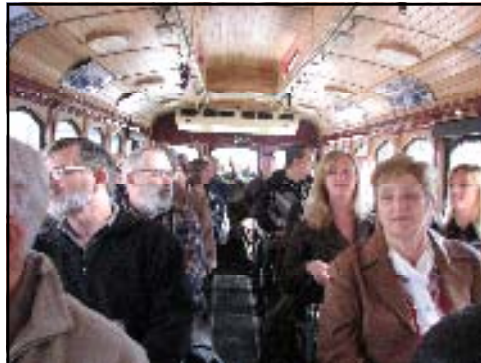
Ride aboard the Trolley to Harrow