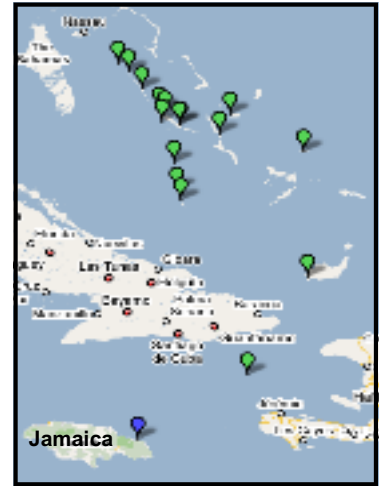
Windsong's current position

A Sign up sheet will also be available in the clubhouse foyer following Launch..