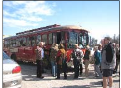
Leaving SPSC All Aboard !!