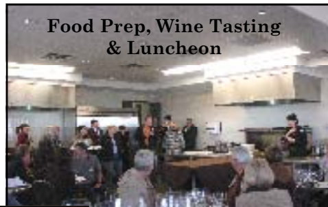
Food Prep, Wine Tasting & Luncheon