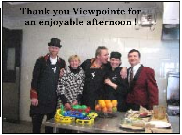
Return to SPSC