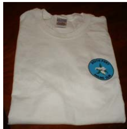
SPSC men's and ladies tees $10.00 each

T-shirts, polos, windshirts, burgees, crests, caps, etc. are available by emailing robtim@cogeco.ca . Items, including pricing, are in the display case in the SPSC foyer. Jackie Timothy will be happy to drop your order off at your home, or meet you at the Club.