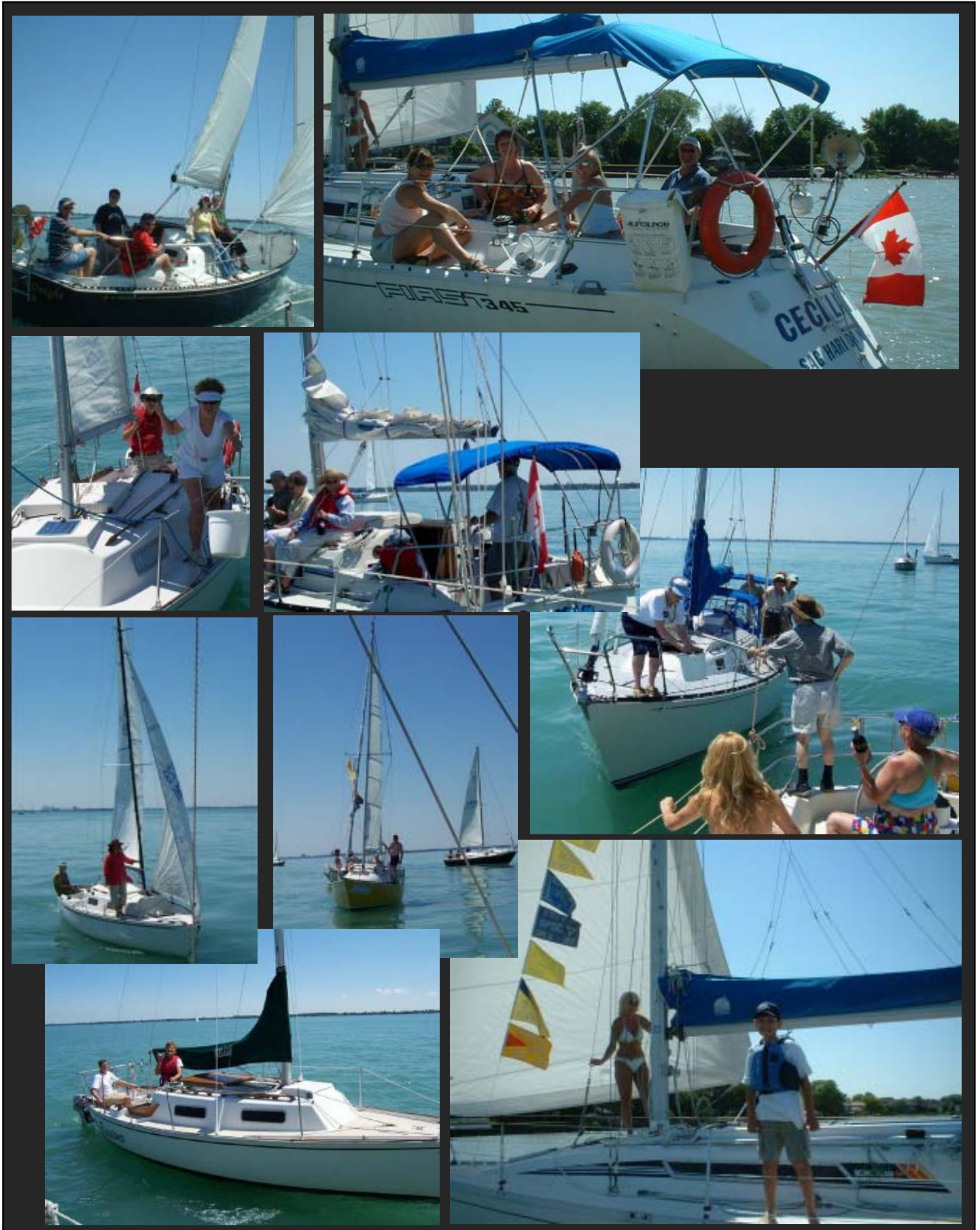
Pg. 4; July 2007 Soundings