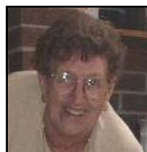
Archives Irene East