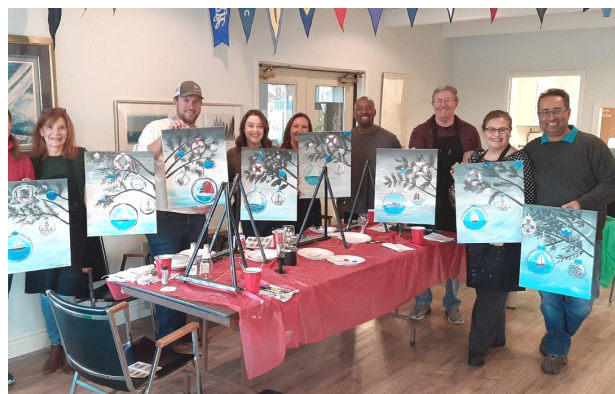
Afternoon Painting party