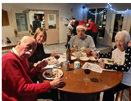
Christmas 2022 Happy Hour