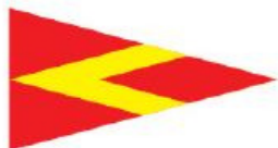
LaSalle Mariners Yacht Club

JOG racing starts Monday, May 15 PHRF racing starts Wednesday, May 17 47 th Annual Shakedown Regatta • Saturday, May 20