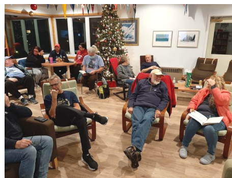
December - 1st of 4 winter race webinars