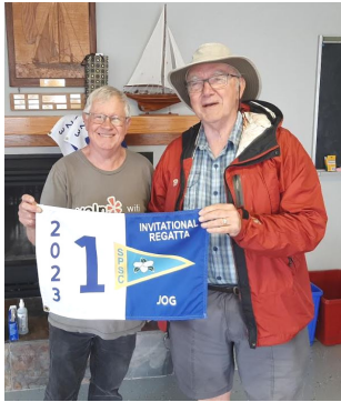
1st Jog Whippet SPSC