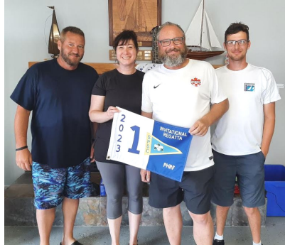
1st PHRF Momentum TRYC