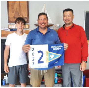
2nd Jog Old 97 SPSC