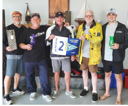
2nd PHRF Bermagui TRYC best Apres-race cocktail