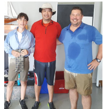
Best dressed crew - Gilligan's Island