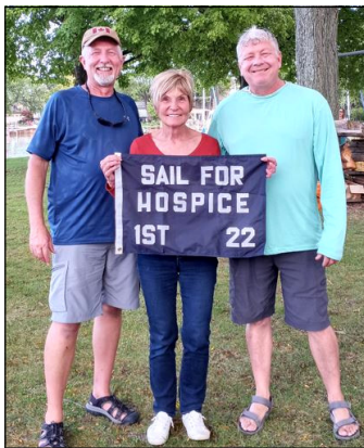
1st JOG No Resistance