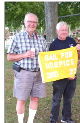
3rd JOG Whippet