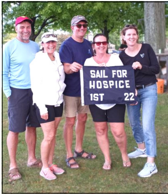
1st PHRF Spitfire