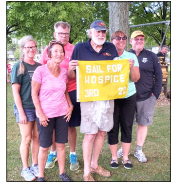
3rd PHRF Firewater