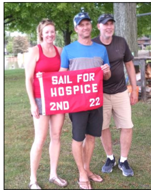
2nd PHRF Ceilidh