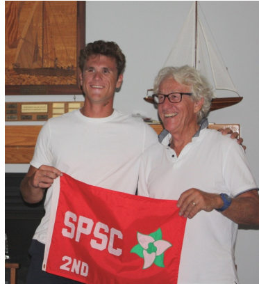
2nd PHRF B Jin Frati Blue Moon