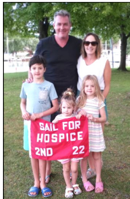
2nd JOG August West