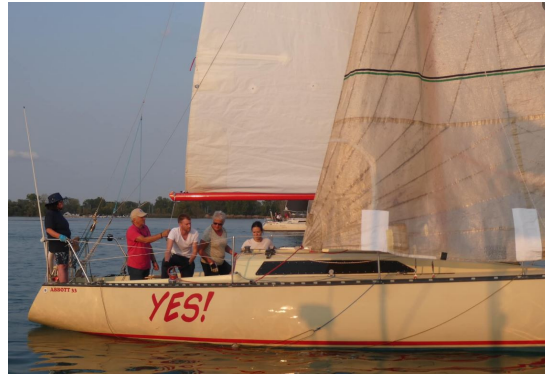
Best corrected YES LMYC