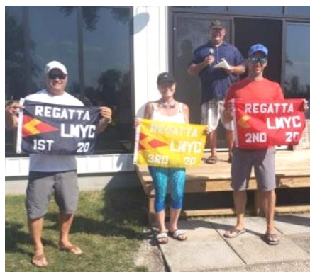
LaSalle Mariners Fighting Island Regatta August 22nd PHRF