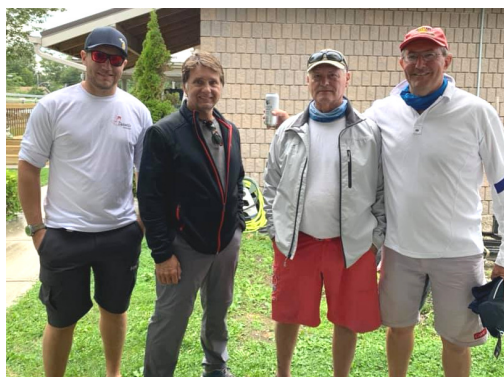
Cedar Island Labour Day Regatta September 6th PHRF