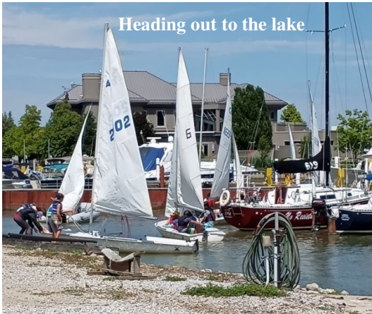
Heading out to the lake