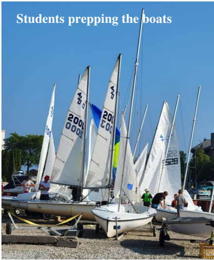
Students prepping the boats