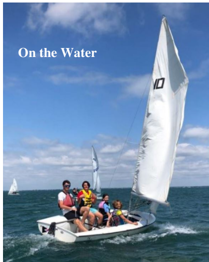
On the Water