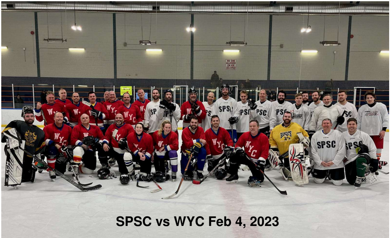
SPSC vs WYC Feb 4, 2023

I'll keep you posted by email and in the newsletter as the season progresses.