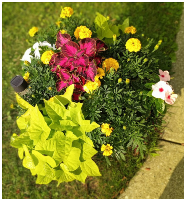
Pots & flowers blooming

I look forward to seeing those interested in setting up some possible dates & destinations on the 5th !