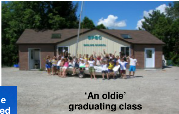
'An oldie' graduating class