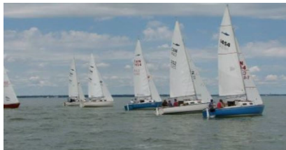
Hal Ebert Memorial Shark Regatta Aug 14-15