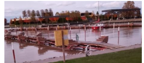
Haul Out Oct 30