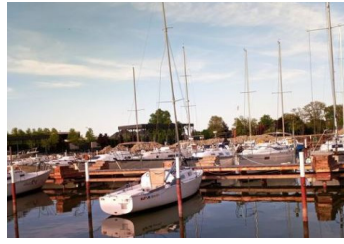
Launch May 15