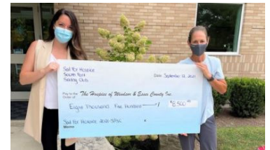
Sail for Hospice Sept 12