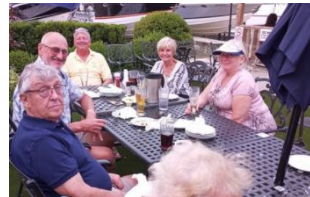
Land cruise to Sandbar Sept 11