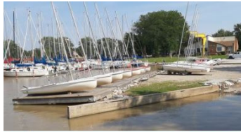
Upgrade to school docks