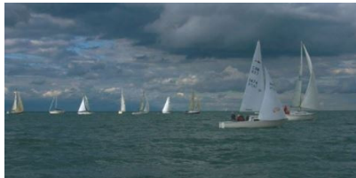
Harvest Moon Sept 18