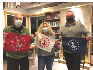
2021 AGM Tuesday November 23rd