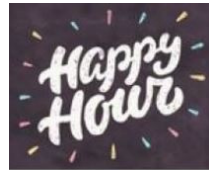
Sept 10 - Oct 1