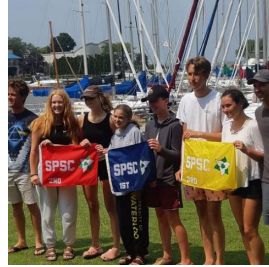
OSA Dinghy Regatta July 31 - Aug 1