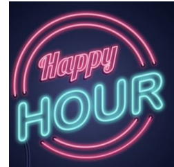
July 9 & August 13