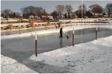
Harbour Skating Feb 2021