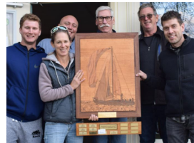
Fall Furl Oct 23