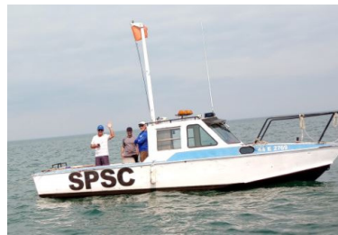
Thursday Fall Series Club Racing Aug 19-Sept 30