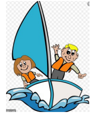
Sailing School classes July-August