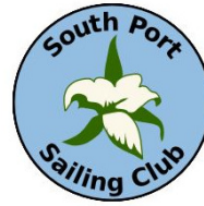
Sail A Bration August 8