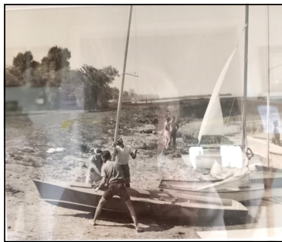
Matta's Park 1964