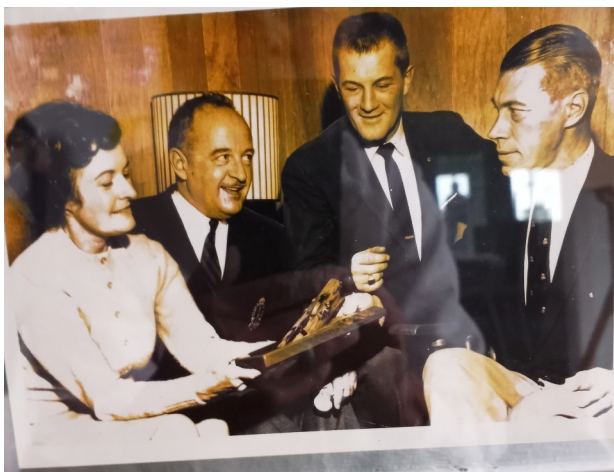
Windsor Star article - November 18, 1963