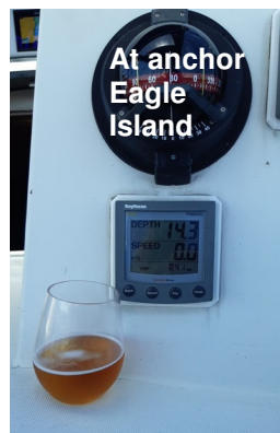
North Channel Sunset