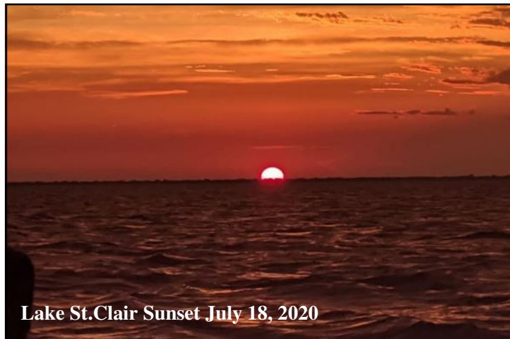
Lake St.Clair Sunset July 18, 2020