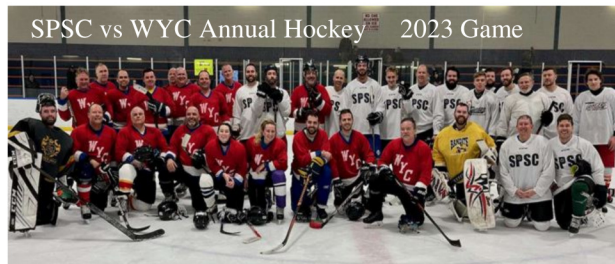
SPSC vs WYC Annual Hockey 2023 Game