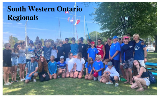
South Western Ontario Regionals