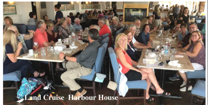
Land Cruise Harbour House