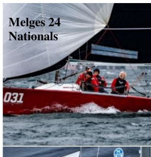
Melges 24 Nationals