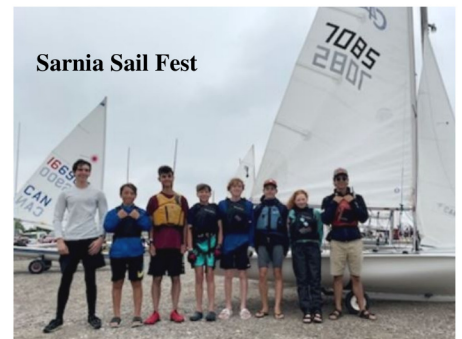
Sarnia Sail Fest