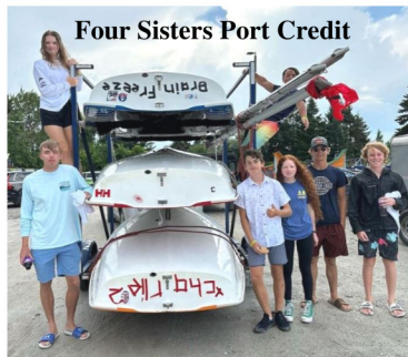
Four Sisters Port Credit