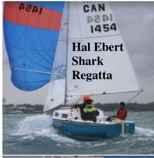
Hal Ebert Shark Regatta