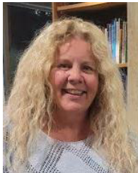
Commodore Pam Morley Cooke

I hope everyone had a safe and happy holiday ! We are another month closer to launching our boats.