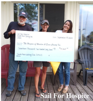
Sail For Hospice