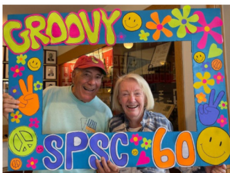
SAIL A BRATION CELEBRATION 60 years