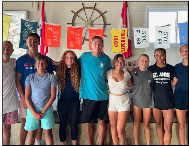
Instructors at Sarnia Sail Training SYC competed on C420's in the first Sid Leaver Regatta with finishes of 2nd 3rd & 4th place